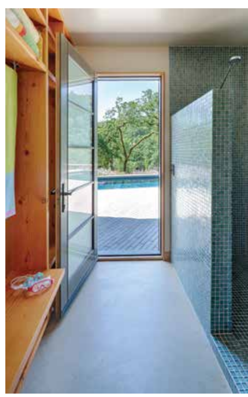
Clockwise from top: La Cantina bi-fold doors connect this straw-bale studio space to the garden and orchard. | The master bedroom windows open to sweeping views, allowing in low winter sun for passive solar heat gain. | The glass-tiled shower and fir storage shelves of the master bath open to the pool area.