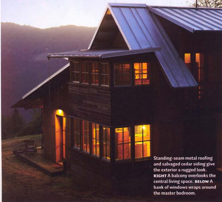
Standing-seam metal roofing and salvaged cedar siding give the exterior a rugged look. RIGHT A balcony overlooks the central living space. BELOW A bank of windows wraps around the master bedroom.